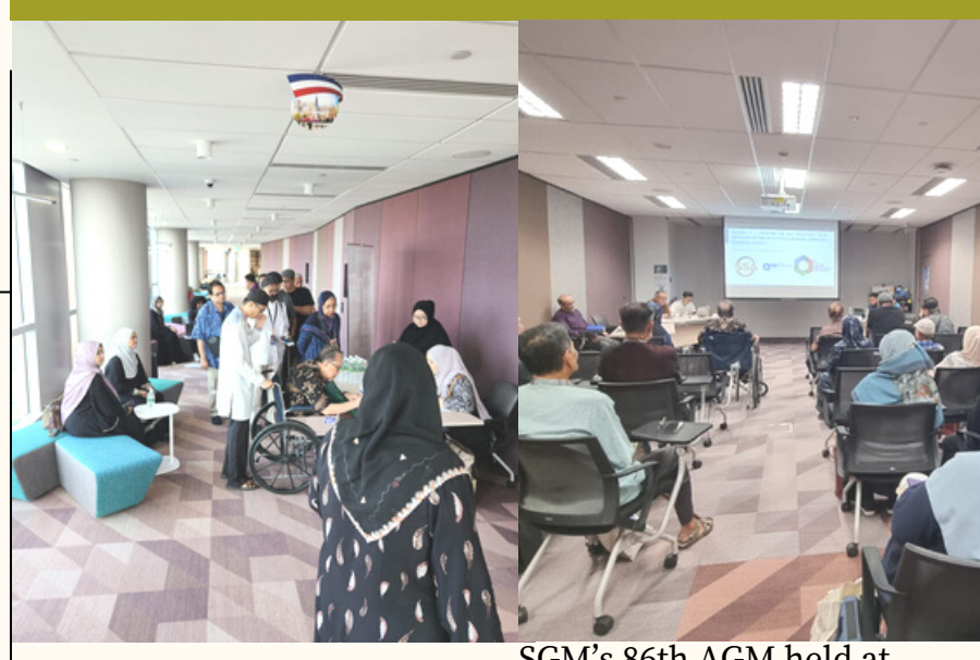
SGM's 86th AGM held at Great Eastern Building

has recently signed agreements with multiple companies (Rakhis Minimart, NOOCC Eye Centre, Matchday Affairs and SGCatHouse) to offer our members an array of delightful discounts and exclusive perks. For further details, please visit our <u>WEBSITE</u>.